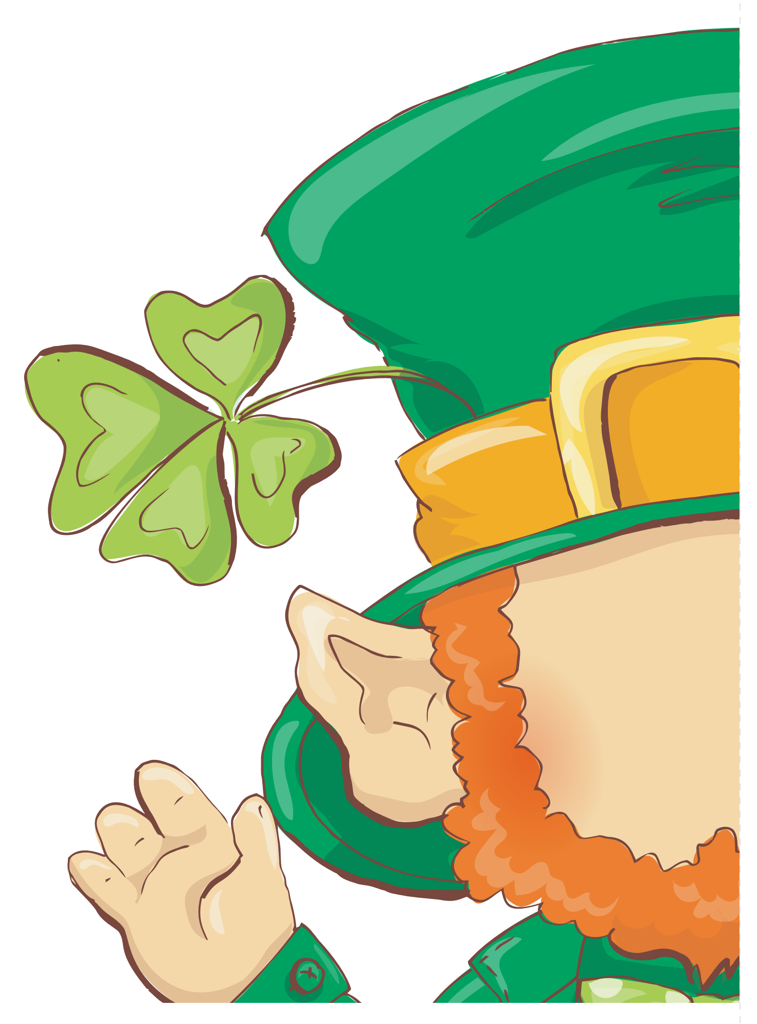
LEAVE THIS PIECE TO ATTACH THE BOTTOM PAGES TO